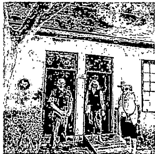
Camel CHC appointees perform conditions assessments summer 2020.